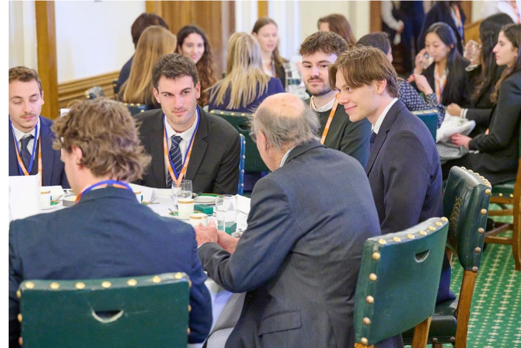
Guests mingle at the House of Commons, London, UK

Our finalists have the chance to engage directly with a curated network of influential figures from diverse sectors, including finance, academia, and government. Previous opportunities for prizewinners included internships with our partner organisations and the chance to present their reports at Buckingham Palace and the Elysée Palace.