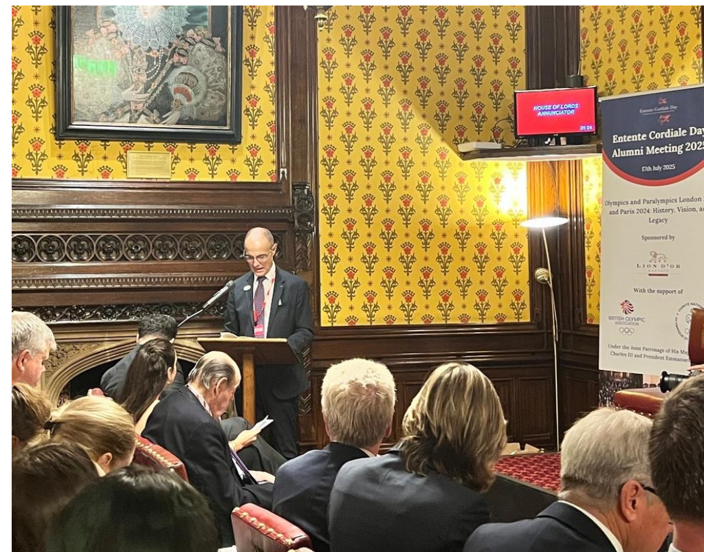
2025 EC Day Alumni Summit at the House of Lords, London, UK