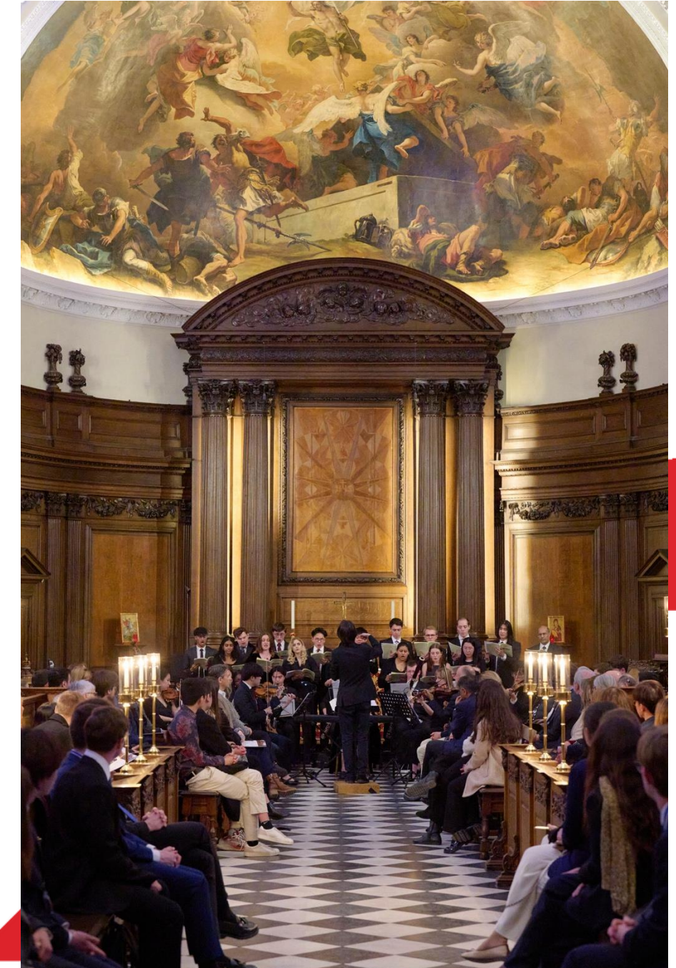
The LSE Chamber Choir performs in the Royal Hospital Chelsea Chapel, London, UK